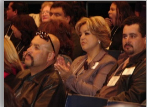
Parents and School Administrators listen to the keynote speaker at the Dec. 2007 Las Vegas graduation ceremony.