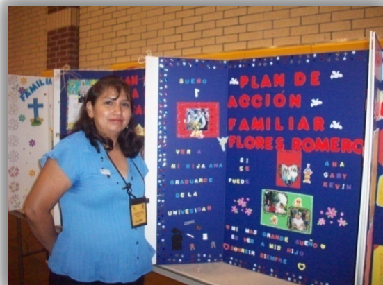
Proud FLI Graduate presents the Flores-Romero Action Plan. Houston, May, 2008.

The workshops are conducted in both English and Spanish. Each workshop contains a series of lectures, participant discussions, storytelling, role-playing, group and individual activities.