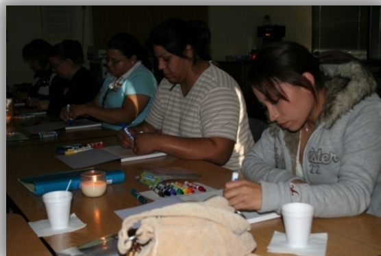
FLI Parents work together at a FLI Workshop.