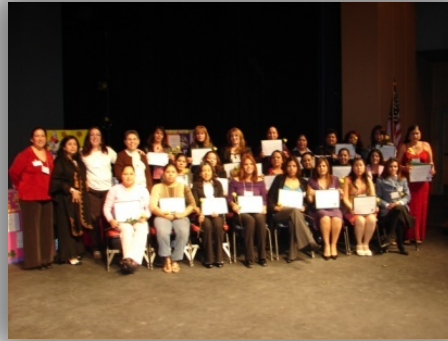
Las Vegas graduating class Dec. 2007.